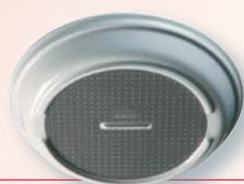
2082F China main course plate, undivided coated for induction Ø 215 mm · Height 40 mm