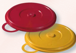
9931RLR Color red 9931RL Color yellow Synthetic lid with ring-tab