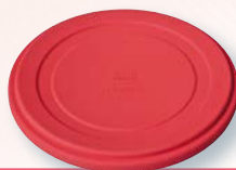
99220 Color red Silicone lid , large, for main course plate