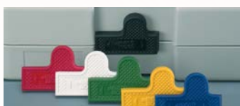
N7770 (black) Slide-locks in colors red, white, green, yellow, blue and black e.g. for easy recognition of different menus. Speeds quick recognition of various menus.