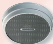
2087F China stew bowl coated for induction 0,8 lit. · Ø 215 mm · Height 43 mm