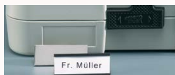
7787S C-Card holder with insertable paper label