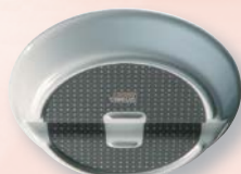
2083F China plate for main course, divided coated for induction Ø 215 mm · Height 40 mm